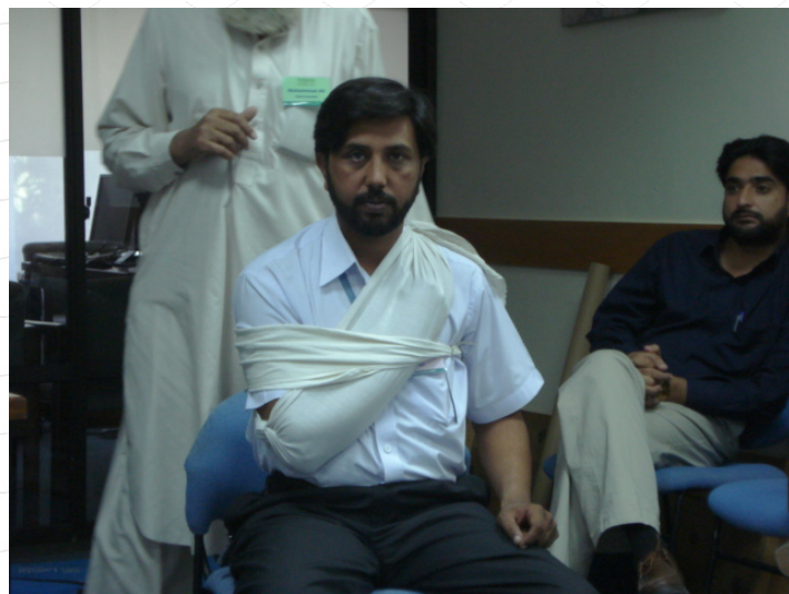
Figure 2: Demonstration of dressing and bandage of an arm injury

After learning about the different conditions of wounds, bleedings and Specific Injuries, the participants were taught the first aid treatment for them. Mr. Ali / Mrs. Mathew explained each situation on different body parts individually. With the help of the material available for dressing and bandages, every part was treated with bandages and dressings. The participants, after learning, practiced the same thing on each other in the form of groups. Mr. Ali / Mrs. Mathew assigned different situations of wounds, injuries and bleedings to each group for practice.