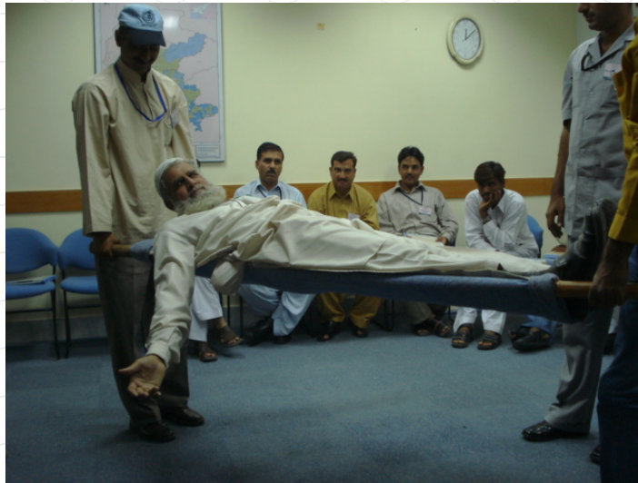
Figure 3: Transporting a patient using blanket stretcher

a chair, moving him by making a cross seating of hands, transporting through a hand made blanket stretcher that usually consists of a sheet or blanket stretched between two poles. Participants enjoyed this session and completed their assignments with great interest.