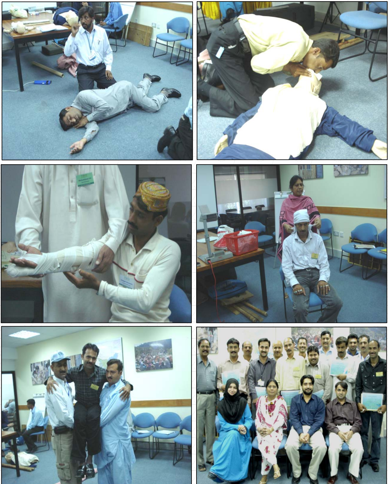
Figure 6: Overall Training Events