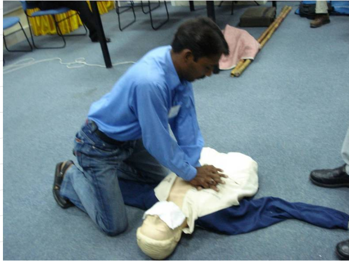
Figure 1: A participant practicing Cardio-pulmonary Resuscitation on a dummy